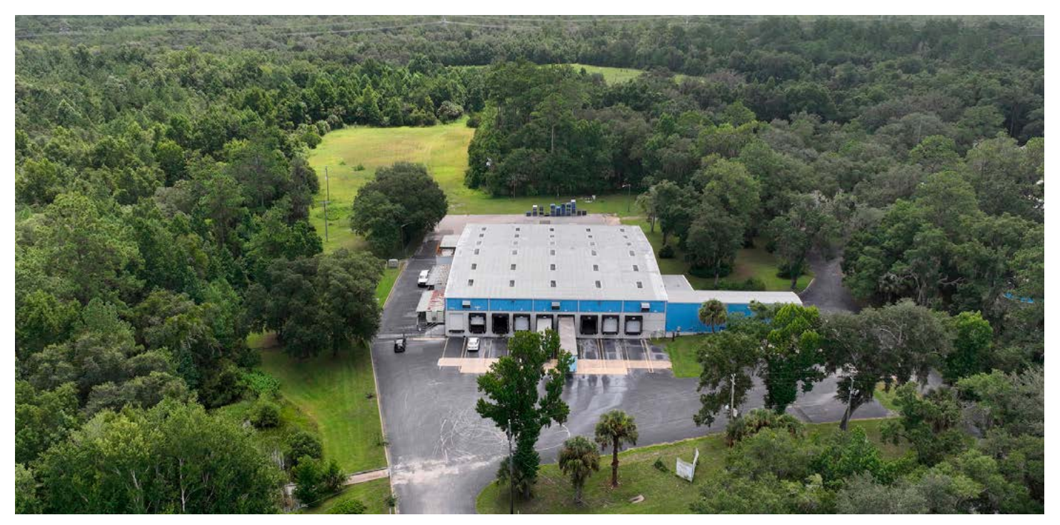
HISTORIC ORANGE SPRING & COMMERCIAL BOTTLING FACILITY