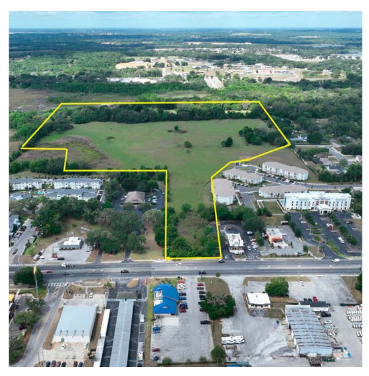
48 ACRE DADE CITY DEVELOPMENT PROPERTY