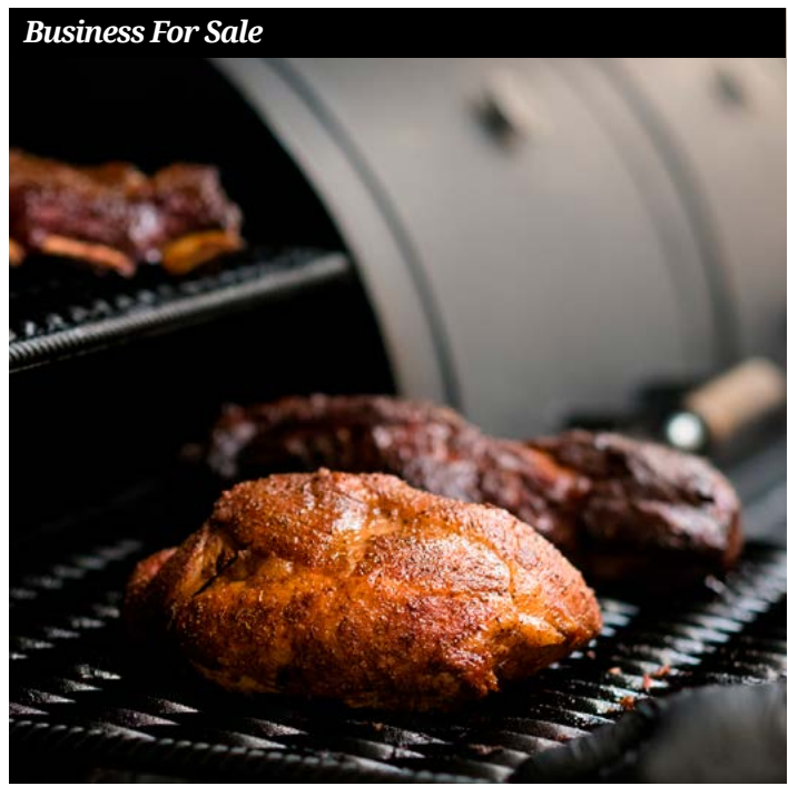
CENTRAL FLORIDA BBQ BUSINESS AND REAL ESTATE