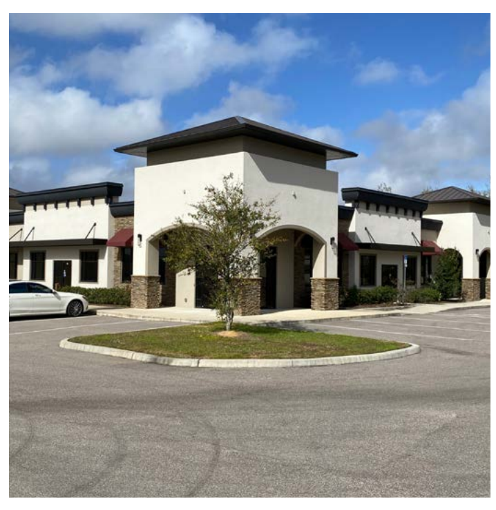
HOOKS ST. MEDICAL OFFICE, CLERMONT

8,000 SF • Clermont • Contact the Advisor