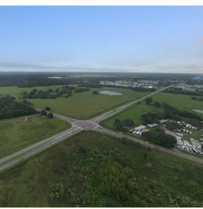
111 ACRES NORTH TAMPA BAY COMMERCIAL PARK