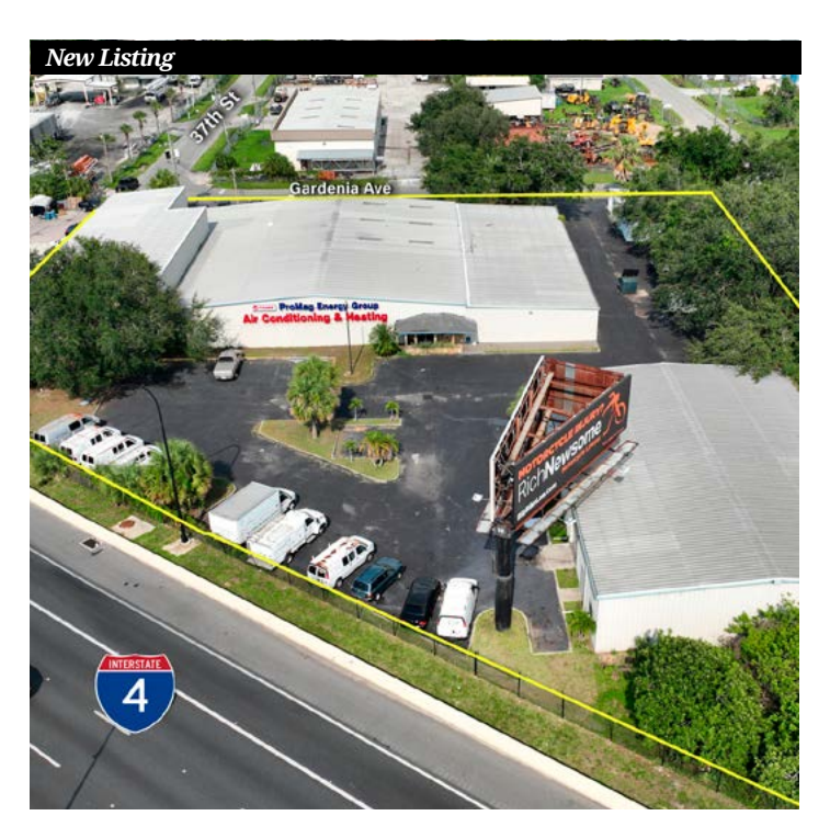
OPTIMAL I-4 INDUSTRIAL WAREHOUSE