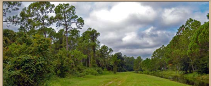
Near Pavilion at Port Orange - Shopping