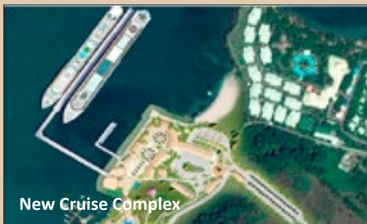
New Cruise Complex

Maimon Bay project, a cruise ship terminal complex opening October 2015