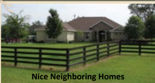
Nice Neighboring Homes