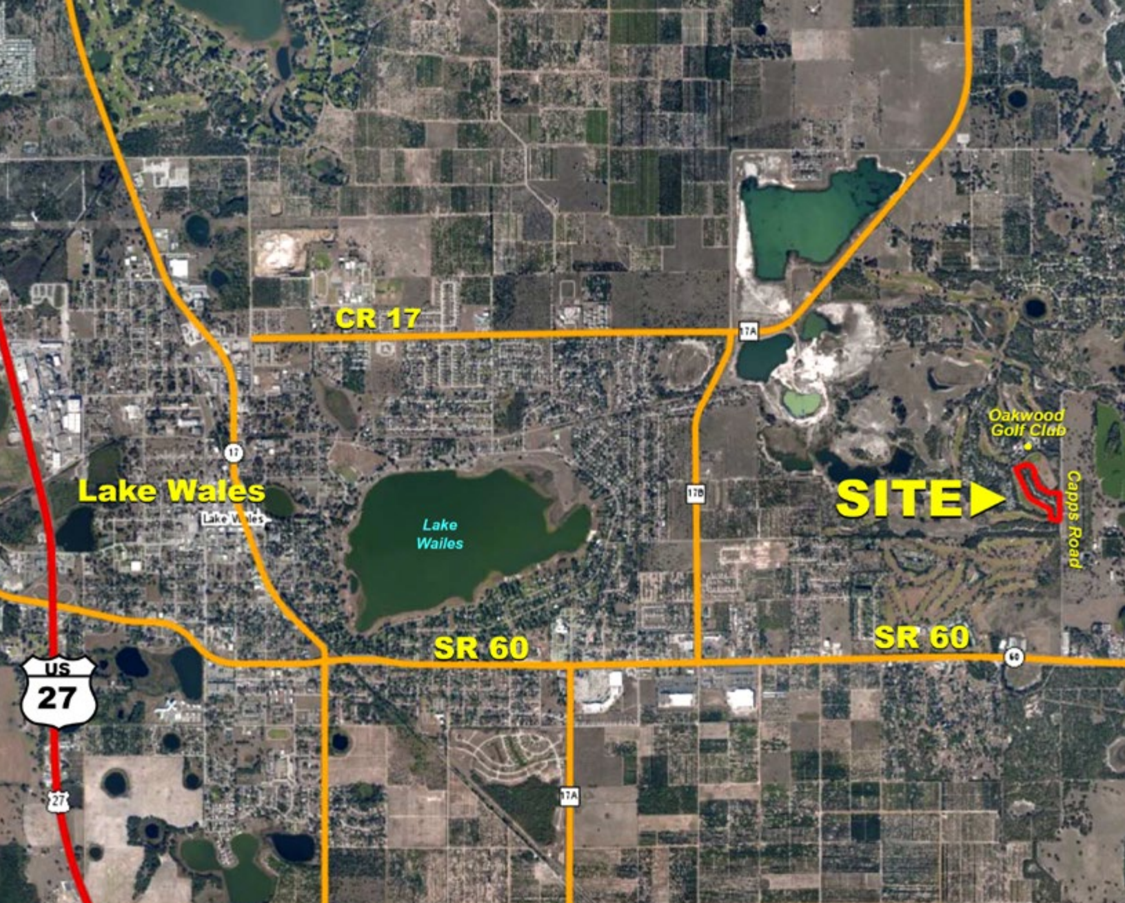
Oakwood Clubhouse Nearby