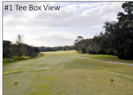
#1 Tee Box View