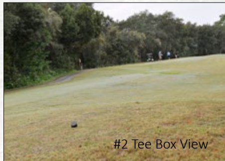
#2 Tee Box View